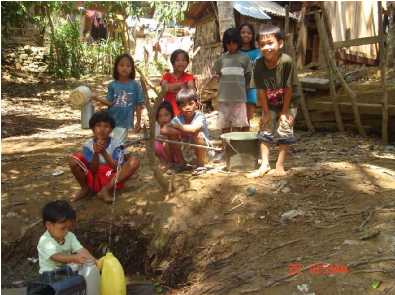
Children collecting water in Kalinga Province

Progress to date has included the development of draft manuals which will be refined over time, dissemination of information about the Project in order that any villages interested in participating know how to become involved, and some initial training.