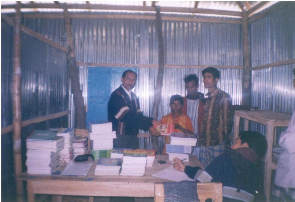
Inside a School at Jamuna River