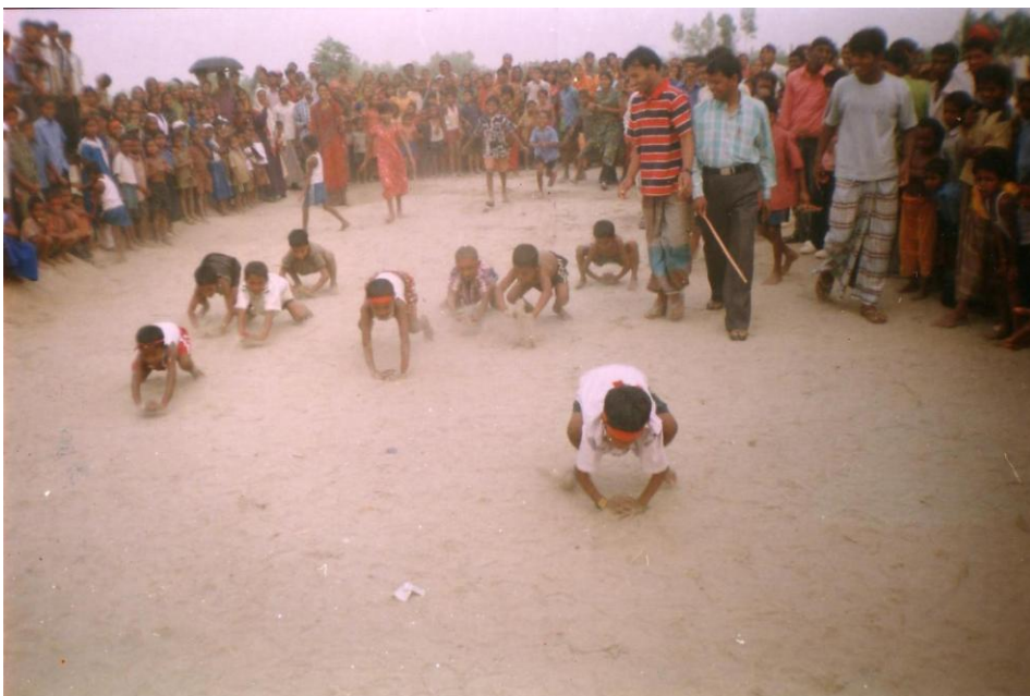
Children playing leapfrog at Jamuna River School

At present, 178 children are studying at the JRDP School in Lokhipur. Resources are basic and the education simple, but the school is well regarded by the local community and the students study hard for their four-times-yearly exams. Fees are kept extremely low to ensure that even the poorest children are not excluded. However, recently it was possible to add an extra room to the school, funded entirely by community contributions since the school began. In time it is hoped that as the other activities of JRDP help the poor to break the cycle of poverty, the community will even develop the capacity to take over the running of the school themselves. Thus the children at Lokhipur will continue to benefit from their 'school on a sandbar' for many years to come.